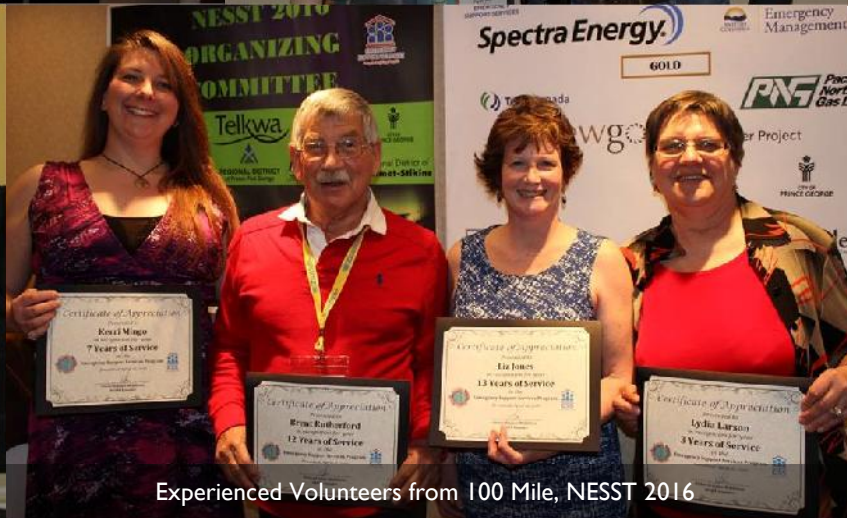
Experienced Volunteers from 100 Mile, NESST 2016