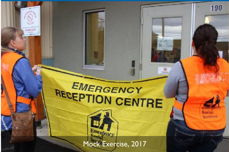
Mock Exercise, 2017

We love our collection of memories from past NESST weekends. This year we encourage you to tag your posts with the #nesst2018 official hashtag so everyone will be able to see your pictures and videos from the weekend.