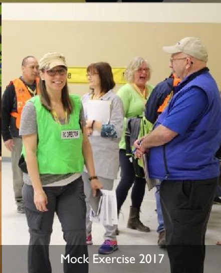
Mock Exercise 2017