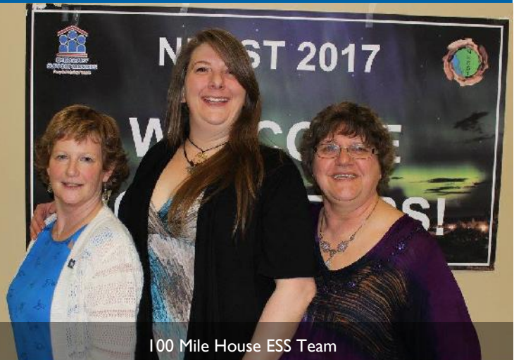
100 Mile House ESS Team