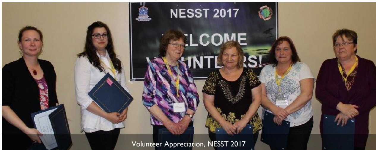
Volunteer Appreciation, NESST 2017