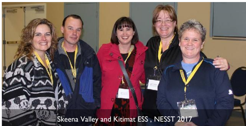
Skeena Valley and Kitimat ESS , NESST 2017