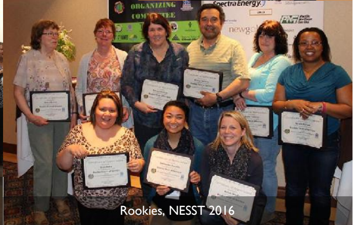
Rookies, NESST 2016