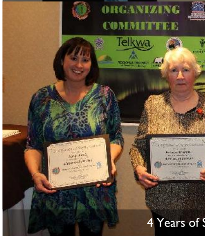
4 Years of Service, NESST 2016