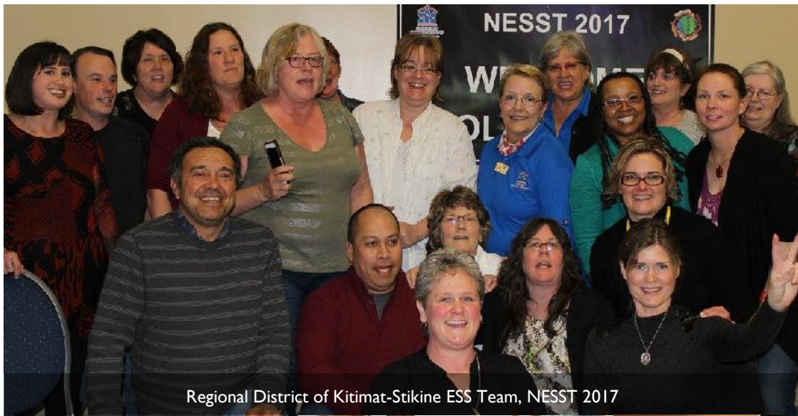
Regional District of Kitimat-Stikine ESS Team, NESST 2017