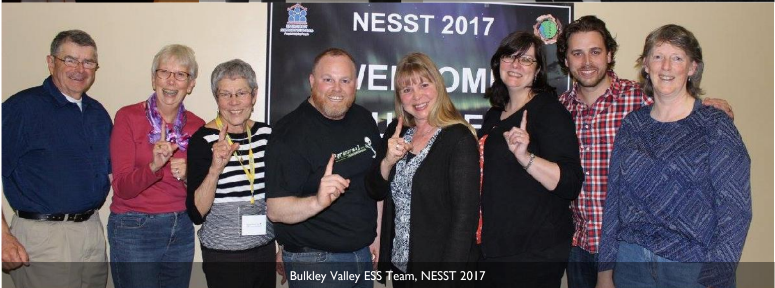
Bulkley Valley ESS Team, NESST 2017