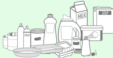
Containers: Plastic, Metal, and Tetra-Pac