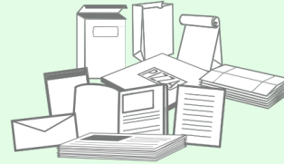
Paper and Boxboard Packaging